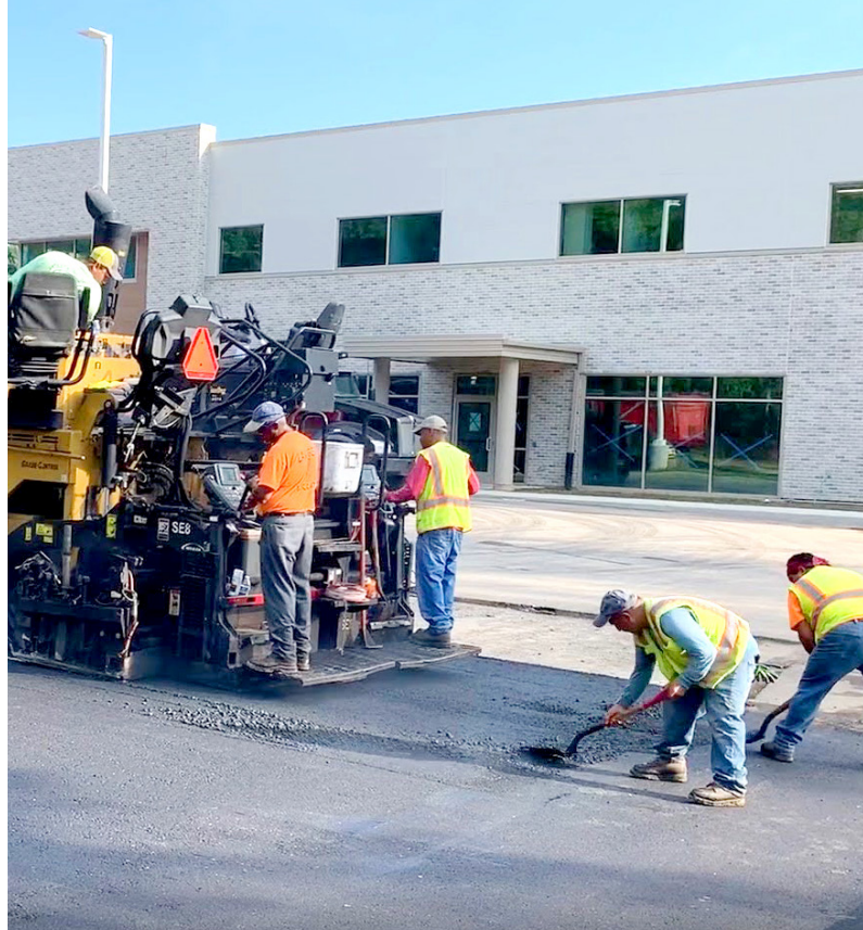
Jawonio, New City, Rockland County

Infrastructure includes transportation systems, roads, bridges, water/sewer, utilities (energy) and more recently upgraded broadband and wi-fi. The operations of infrastructure systems is critical to everyday life. These systems, which include water, sewer, and wastewater, must be operating at full capacity for the region to function. Despite significant improvements there exist many examples of infrastructure in need of significant investment. Many of the operators within