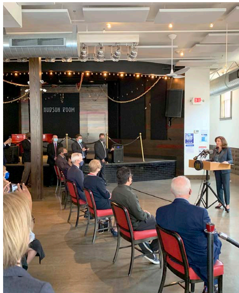
Lieutenant Governor Kathleen Hochul, DRI Project Announcements, Peekskill, Westchester County

Through the work groups and public meetings, the Council will continue to provide ways to keep the public informed about the REDC process and offer opportunities to continue to refine the regional strategy as the region, state, and world continue to emerge from the COVID-19 crisis.