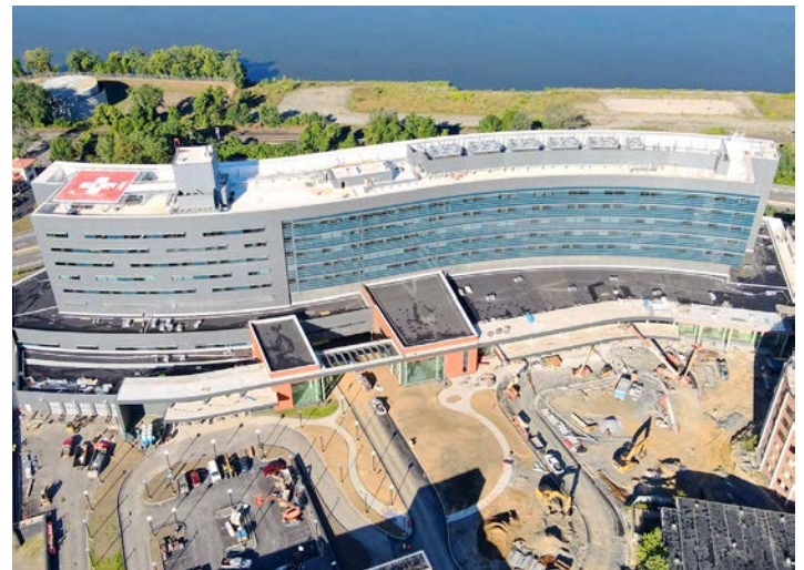
Vassar Brothers Medical Center, Poughkeepsie, Dutchess County