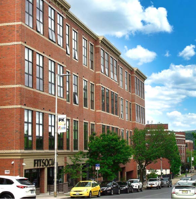
Queen City Lofts, Poughkeepsie, Dutchess County