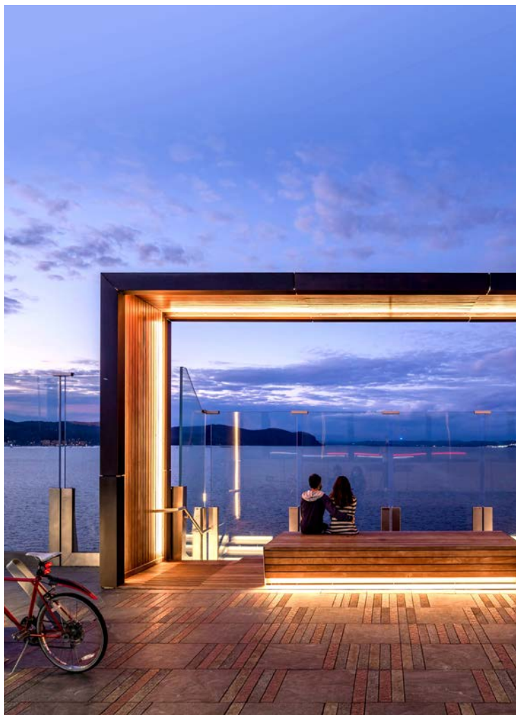
Painters Point, Governor Mario M. Cuomo Bridge

The challenges associated with these changes simultaneously represent opportunities to advance the region and continue to improve resiliency while adapting to the new normal and preparing for potential future shocks to the economy. Advances made in technology over the last sixteen months have led to efficiencies within the public and private sectors with new delivery systems for government and corporate services. The assessment of challenges has resulted in the Council's continued resolve in accomplishing the strategy of LIVE, WORK, PLAY . Further, the Council must move forward with the implementation of the strategy through the lens of diversity, equity, and inclusion.