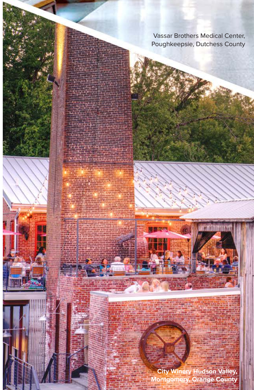
City Winery Hudson Valley, Montgomery, Orange County