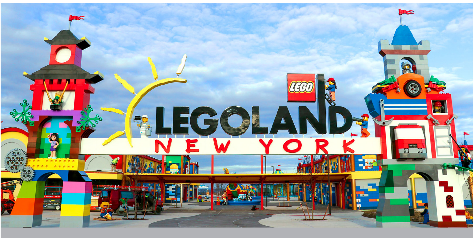
LEGOLAND New York, Goshen, Orange County