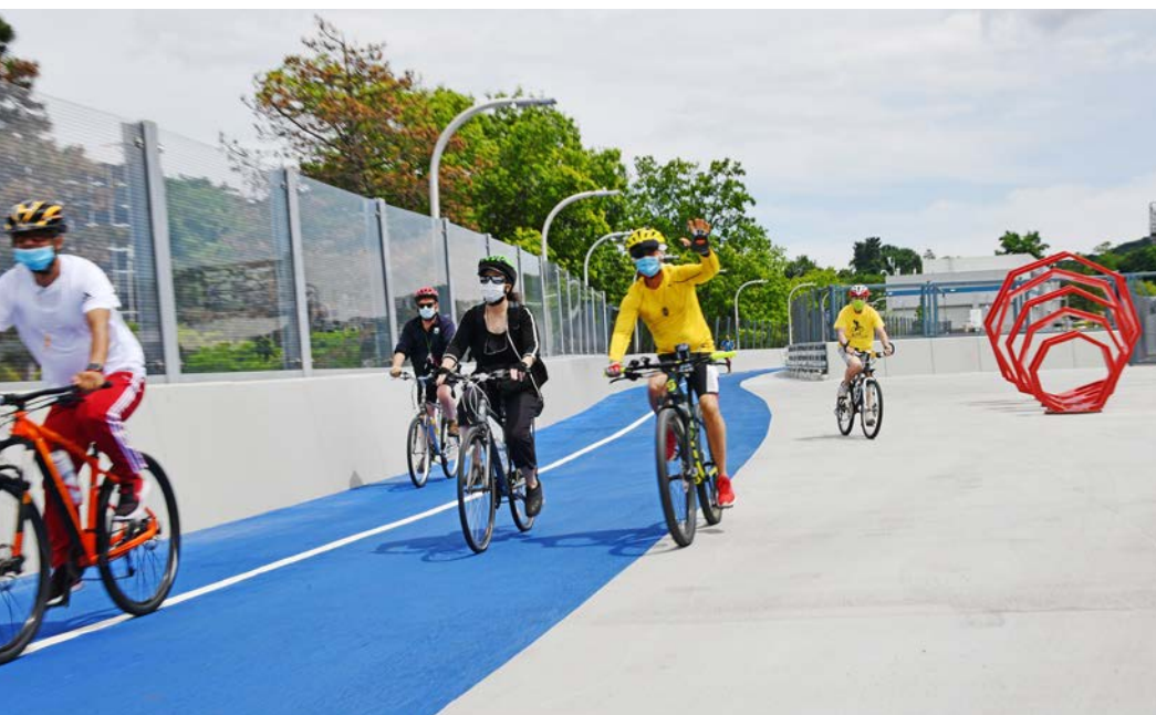
Shared Pedestrian Walkway, Governor Mario M. Cuomo Bridge

these specialized fields are retiring and there must be a succession and talent attraction plan established. A combination of remote work, anxiety and fear of dense urban environments, is reducing the volume of commuters and putting additional stresses on other regional infrastructure systems. While traditional infrastructure will always need continuous investment, other areas - “Green” and broadband – now require specific attention and funding.