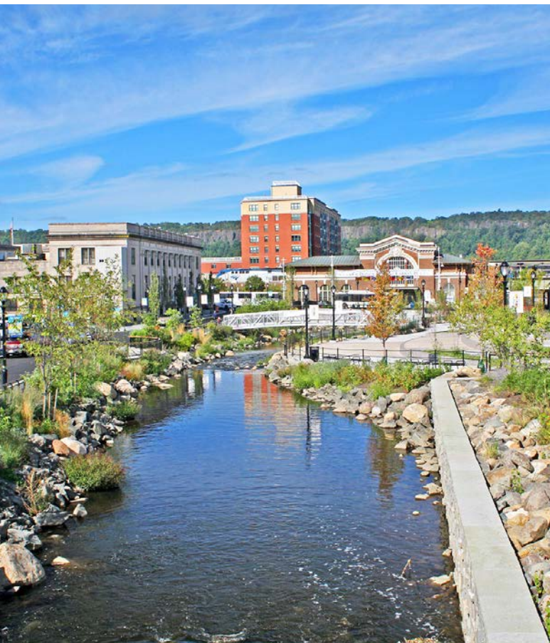
Saw Mill River Daylighting, Yonkers, Westchester County