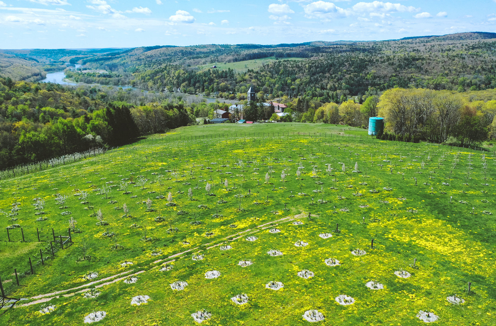
Seminary Hill Ciders, Callicoon, Sullivan County

As foot traffic became non-existent, the region witnessed the loss of many cafes, restaurants, boutiques, specialty shops, and other “Main Street” businesses. Some of these businesses were able to capture additional revenue by increasing or creating an online presence, but not all.