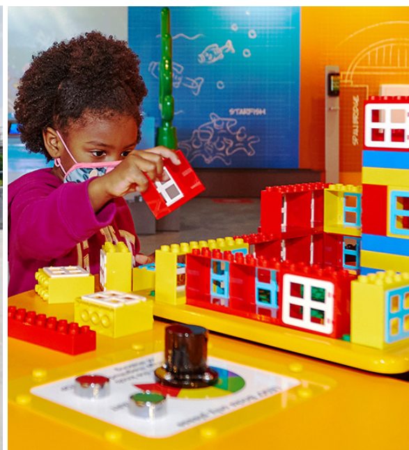
LEGOLAND New York, Goshen, Orange County