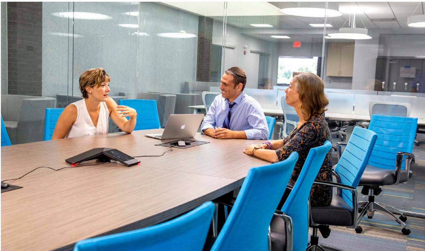
New York Medical College, Valhalla, Westchester County

Generating more than $1.6 Billion in Economic Activity