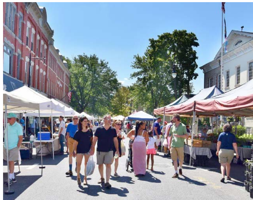
Downtown Kingston, Ulster County