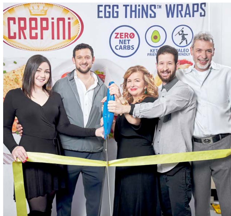
Crepini, Fishkill, Dutchess County

The Council's efforts in workforce development fall under the WORK strategy. For more information on this strategy and how it has been affected by COVID-19, please refer to pages 16-17 of this report.