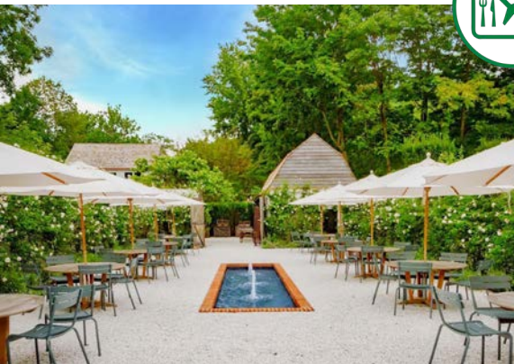
Tuxedo/Sloatsburg Corridor Revitalization Project – Sloatsburg, Rockland County