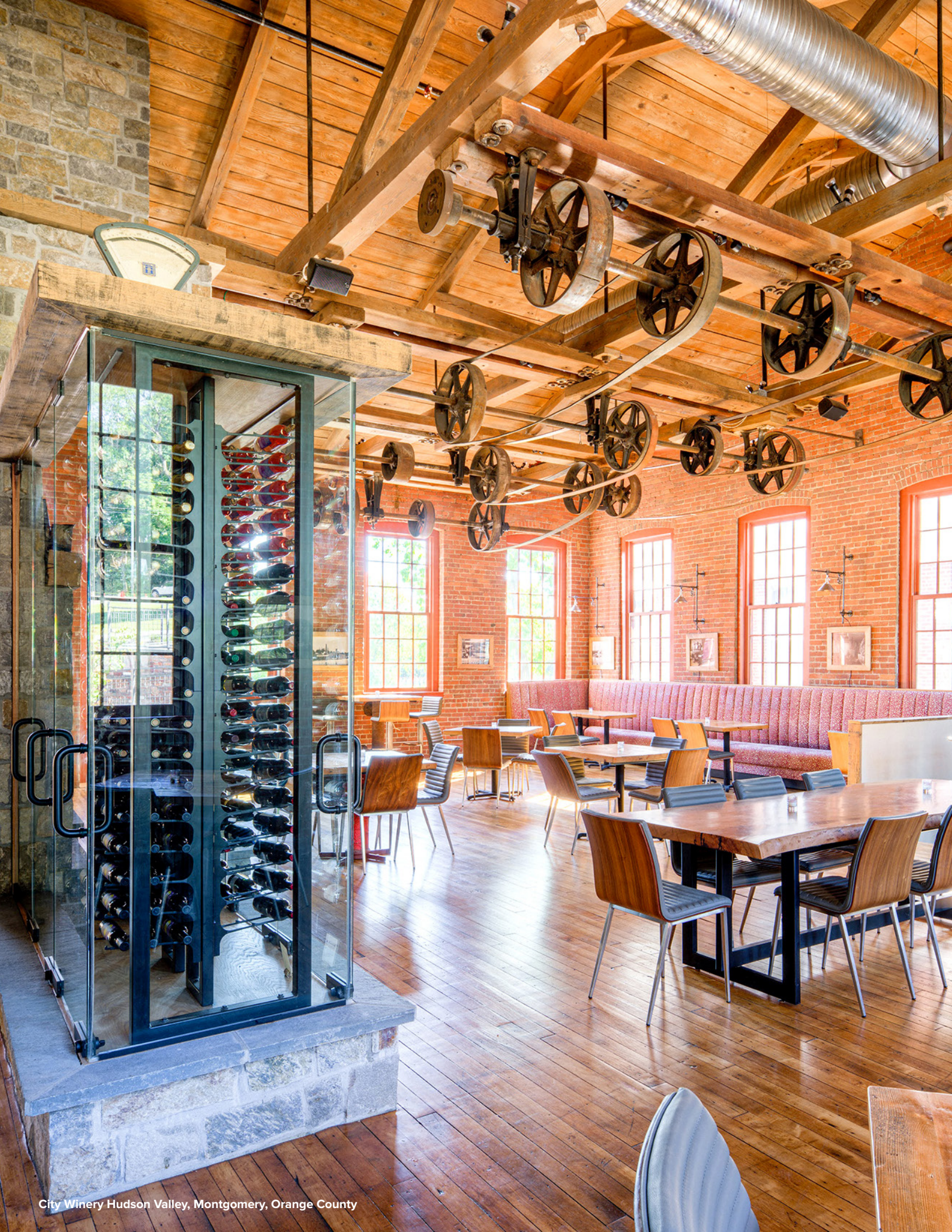
City Winery Hudson Valley, Montgomery, Orange County