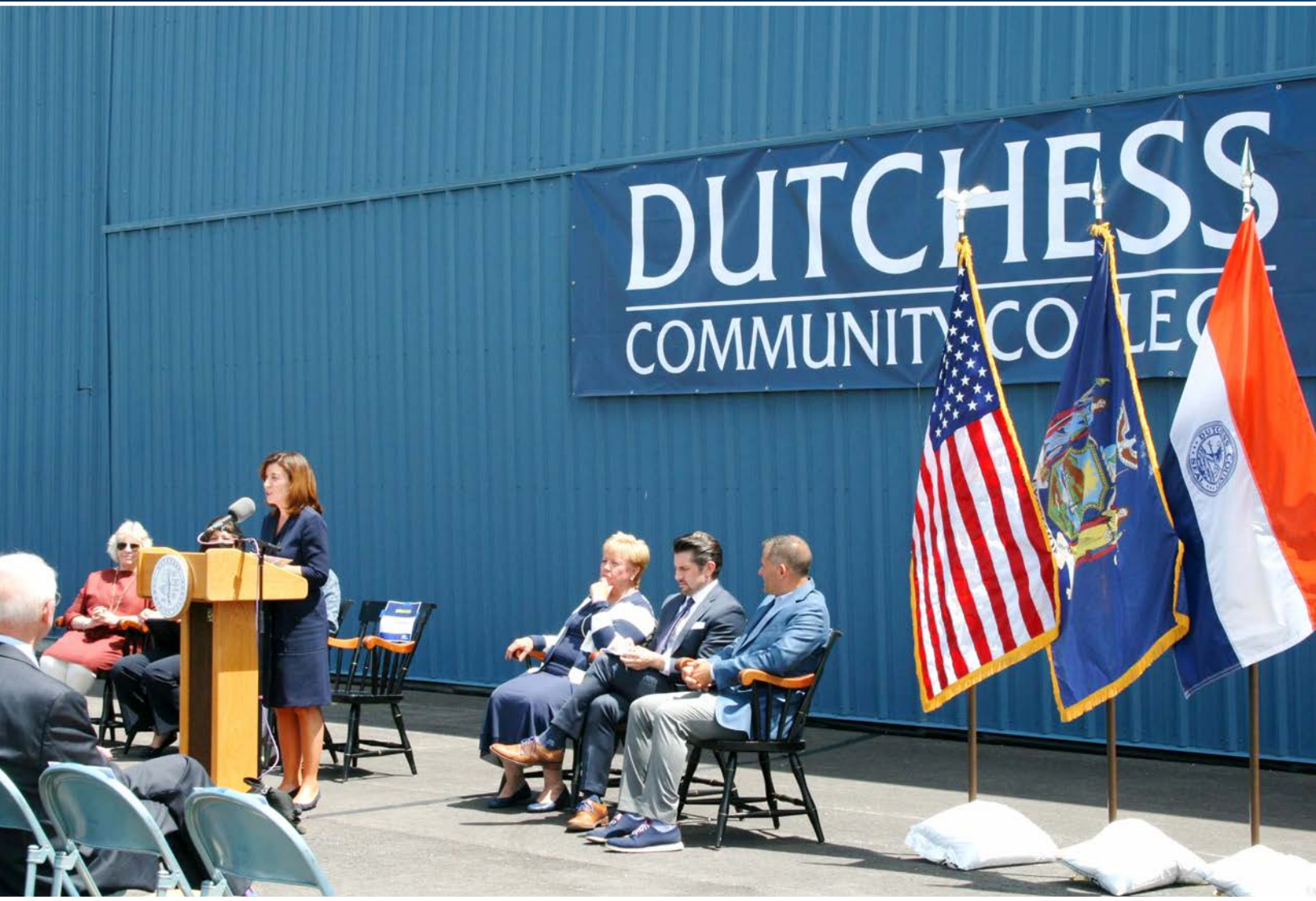
Dutchess Community College Aviation Education Center, Wappingers Falls, Dutchess County