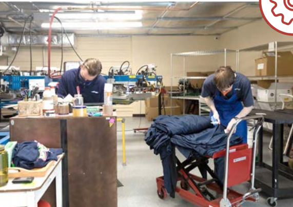
Spectrum Designs, Nicholas Center, Pleasantville, Westchester County