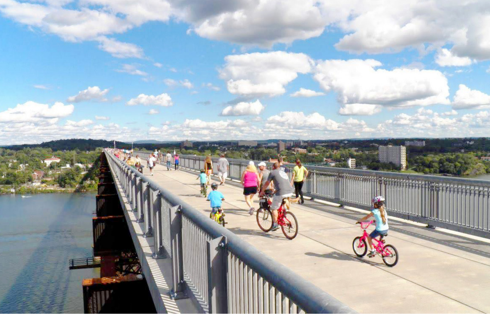
Walkway Over The Hudson