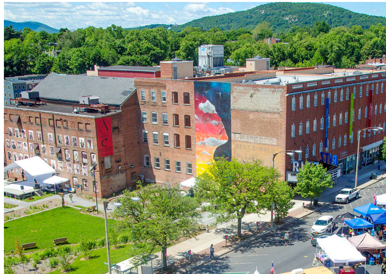
Safe Harbors of the Hudson, Newburgh, Orange County

The Council looks forward to future rounds of the DRI and will once again actively promote the opportunity throughout the region.