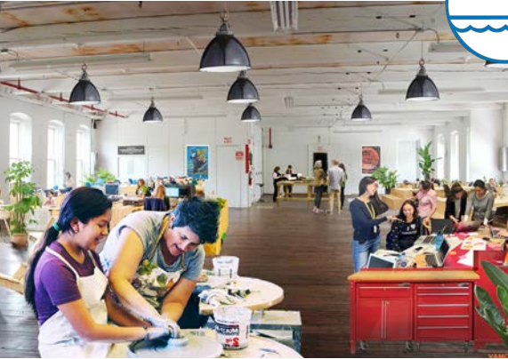
Thornwillow Makers Village, Newburgh, Orange County